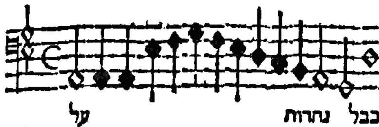
Figure 9. Rossi, "Al Naharot Bavel," opening bass line