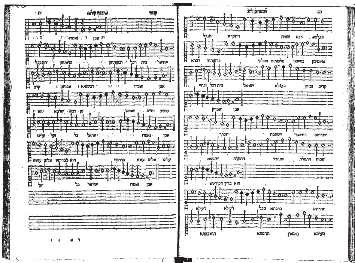
Figure 5. Rossi, “Kaddish,” canto.

The bass line of Rossi's " Al Naharot Bavel " is nearly identical to that of his Mantuan colleague Lodovico Viadana's " Super flumina Babylonis ," a setting of the same text (Psalm 137) in Latin (see Figures 9 and 10 on page 17). Both Rossi and Viadana are indulging in some word