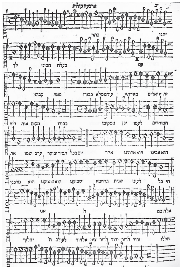
Figure 2. Rossi, “ Keter ,” canto.

We can see on this title page some of the challenges of a bi-cultural identity. To describe what they were creating, the authors had to borrow or invent words that did not exist in the Hebrew language. The first word on the page is “ basso ,” the Italian word meaning bass, spelled out in Hebrew letters. 16 There was no word for harmony or polyphony in Hebrew, so the authors used the Italian word “ musica ,” again spelled with Hebrew letters. Indeed, the very concept of this book is predicated on both its authors’ and its readers’ ability to negotiate multiple identities. In these polyphonic motets the lyrics are in Hebrew, and the context is the synagogue worship service. But the musical styles, the convention of notation, the musical terminology, and the performative aspect are all borrowed from the culture of Christian Europe.