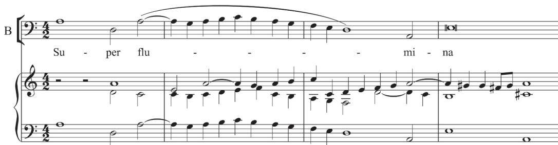
Figure 10. Lodovico Viadana, Super flumina , First Phrase.