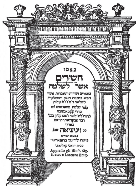
Figure 1. Rossi. Ha-Shirim, basso , title page.

As far as we know there were no precedents for Rossi’s innovation. Certainly, the composer himself believed that was the case. Figure 1 shows the title page of Rossi’s 1622 publication of his thirty-three polyphonic motets for the synagogue. Notice the words “new in the land.” The title page, like the rest of the book, is written almost totally in Hebrew. Here is a translation.