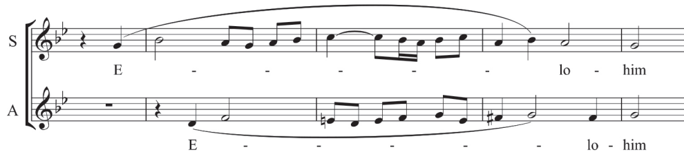
Figure 7. Salomone Rossi, Elohim Hashivenu , Author's Edition, Second Duet.